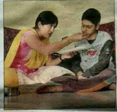
ಮೇಣದ ಬತ್ತಿ ತಯಾರಿಕೆಯಲ್ಲಿ ತೊಡಗಿರುವ ವಿಕೇಷ ಮಕ್ಕಳು (ಎಡ) ಕೇಂದ್ರದ ವಿದ್ಯಾರ್ಥಿಗಳಿಗೆ ಊಟ ಮಾಡಿಸುತ್ತಿರುವುದು